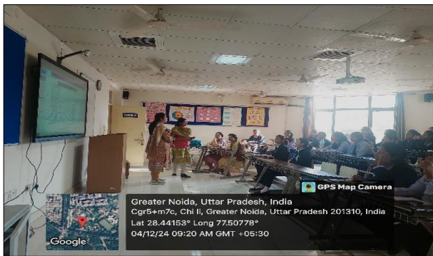
Orientation for Sem-4