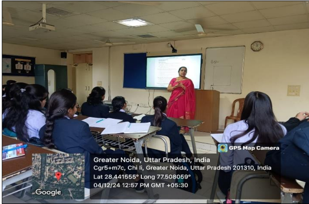
Lecture on “Professional Ethics”