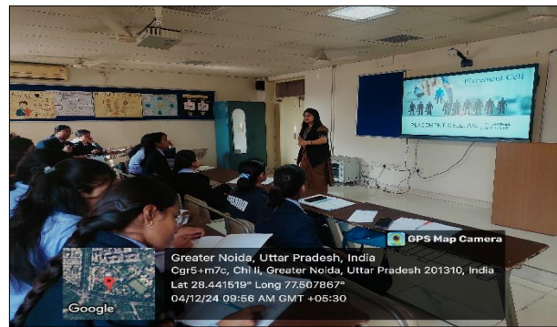
Orientation to placement activities